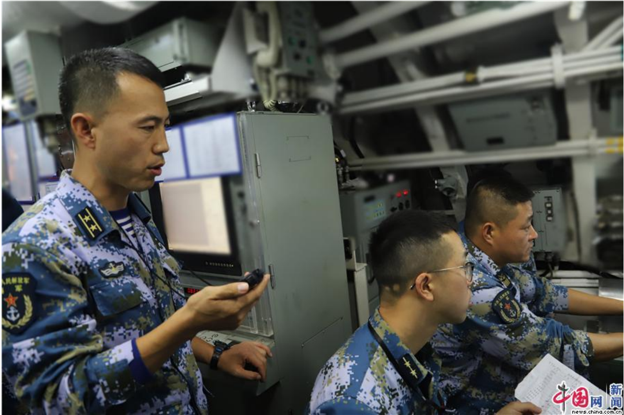
Submarine officer supervises junior sailor.

Since Xi Jinping became chair of the Central Military Commission in 2013, the People's Liberation Army Navy (PLAN) has increasingly sent its submarine force further afield on longer distance deployments. [1] Submarines operate relatively independently below the waves, so the competence of individual boat commanders can have a significant influence on the effectiveness of operations. However, autonomy is something to which the PLA has historically given short shrift ( China Brief , August 17, 2012). Chinese-language sources indicate that this logic extends throughout the PLAN. Within the submarine force specifically, experts have highlighted longstanding shortfalls in trust and confidence between submarine unit leadership and the commanders of their subordinate boats. [2] For decades, this manifested in an unofficial practice (which has never been stipulated in official regulations) of dispatching additional commanders—who are also Party members—on every mission alongside boat commanders. Experts have criticized the policy for constraining the autonomy, and thus the efficacy, of the boat commanders. This led to some proposed reforms across the PLAN in 2016. However, while references to the practice in the literature have dwindled in the years since, sources suggest that it persists within the submarine force. The continuation of this practice must therefore be factored into any analysis of the force's capabilities in the event of a kinetic conflict.