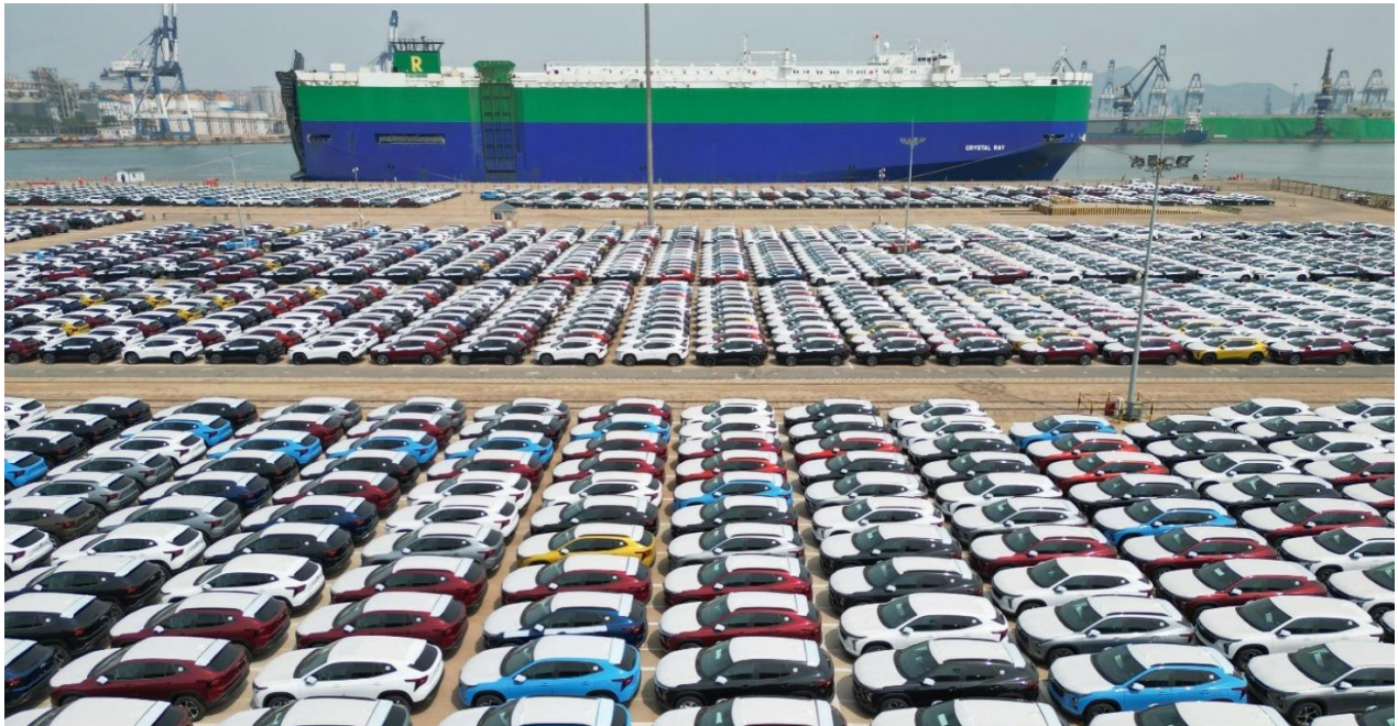
Chinese cars waiting to be shipped overseas.

At the end of September, the 2023 China International Automobile Exhibition opened in Tianjin. An official representing the China Council for the Promotion of International Trade (CCPIT) delivered a speech, announcing that China's automobile exports are expected to exceed four million units this year ( Kuai Keji , September 28). According to the most recent data, China exported just shy of three million vehicles from January to August, up 61.9 percent from 2022. This means that China is set to surpass Japan—as it overtook Germany last year—to become the world's largest automobile exporter for the first time.