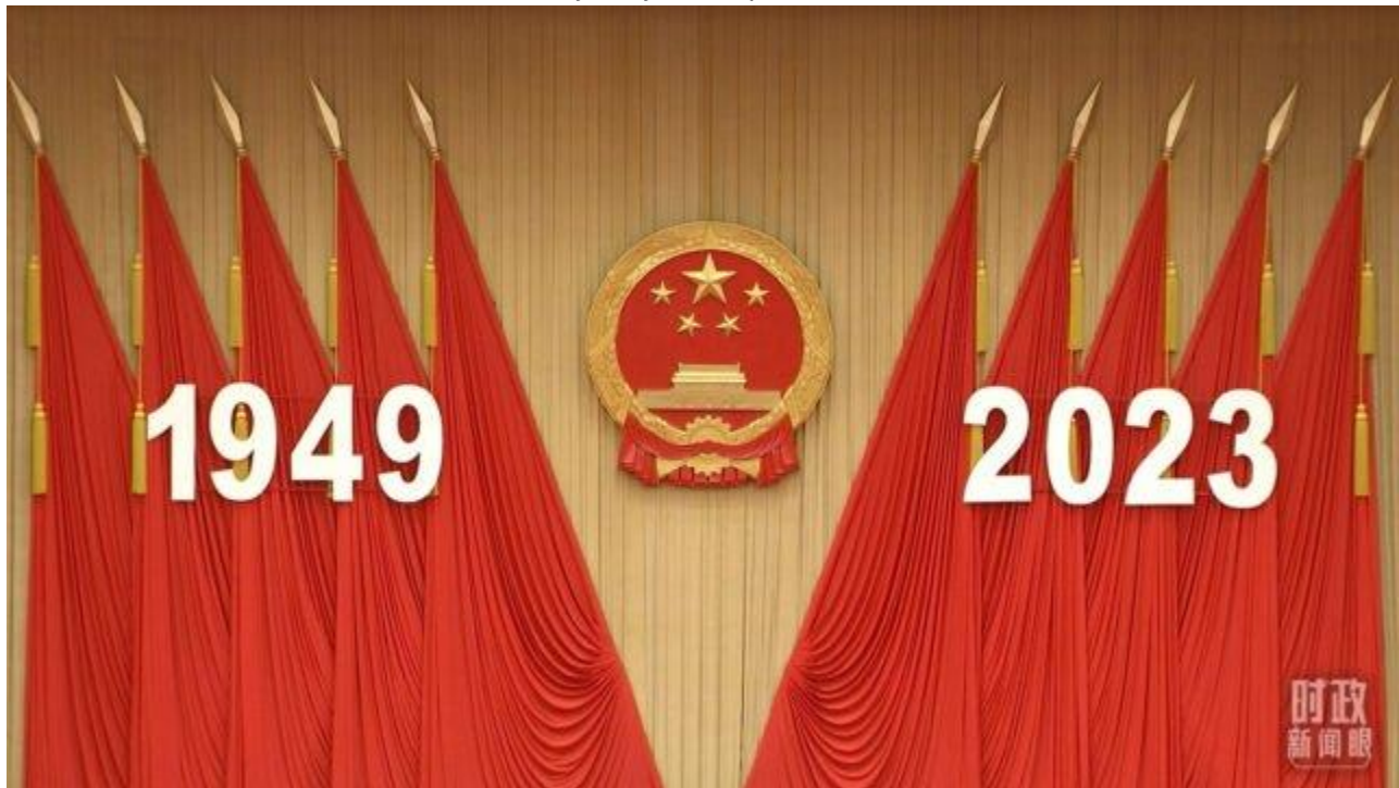
The interior of the Great Hall of the People on National Day, 2023.

Chinese President Xi Jinping (习近平) faces a dilemma. Around a dozen of his protégés have been found to be so corrupt that the Chinese Communist Party (CCP) General Secretary and Commander-in-Chief is no longer sure of the efficacy of the PLA's trump-card weapons ( BBC Chinese , September 22; VOAChinese , September 17). These men populate the upper echelons of the People's Liberation Army's (PLA) Rocket Force and the Central Military Commission Equipment Development Department, which handle China's missile and nuclear hardware and the procurement of top-level equipment for ICBMs, nuclear submarines, and spatial vehicles.