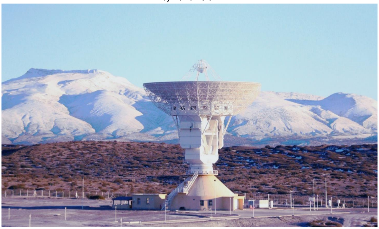
The Espacio Lejano Station in Neuguén Province, Argentina.

Observers assessed the outcome of the first round of Argentina's presidential elections held on October 22 as good news for the Chinese government (VOA, October 26). Against the odds, Sergio Massa, the Peronist candidate and current minister of economy, emerged on top, despite his overseeing an annual inflation rate of almost 140 percent. Meanwhile, Javier Milei, the libertarian opposition candidate, took the second place (Yahoo Noticias, October 23). These two politicians will compete for the presidency in the second round of the election scheduled for November 19.